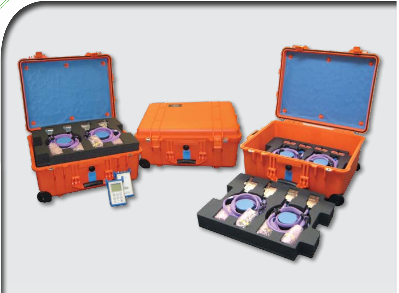
Test & Inspection Equipment