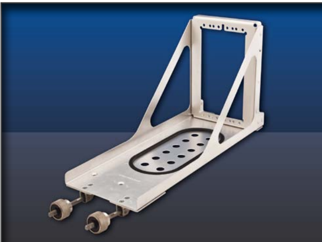
P/N: 200-23558-101 Tray