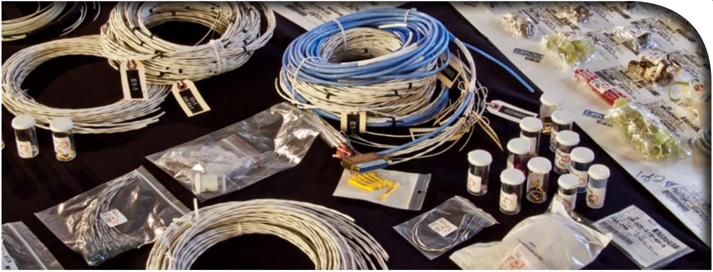
Airbus A320 EFB Systems Provisions Installation Kit