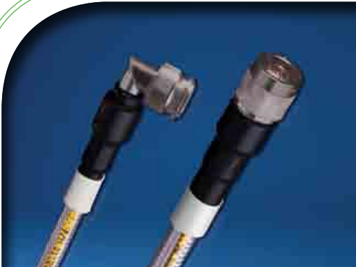
311201 and 310801 low PIM Cable Assemblies