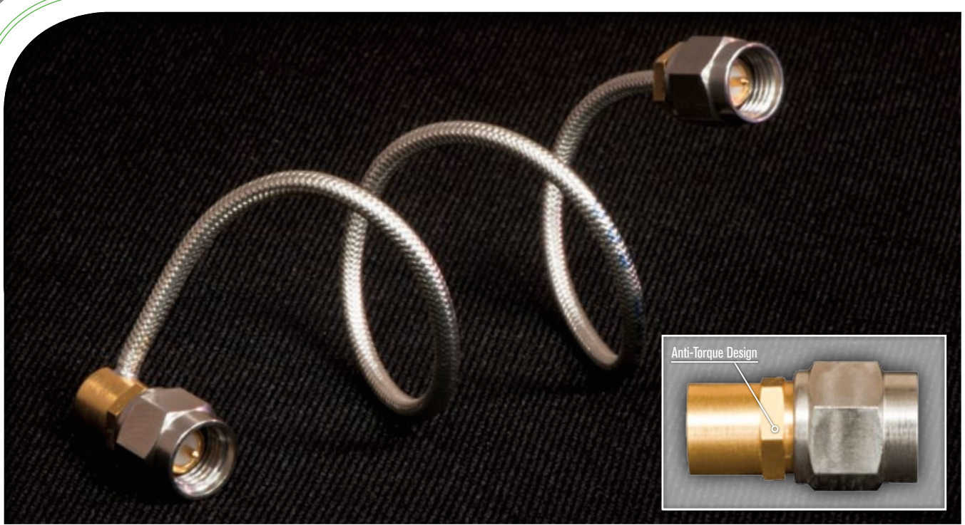
Semi-Flex Cable Assembly