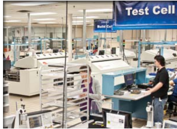
Burn-in, thermal shock and thermal cycle testing available in-house